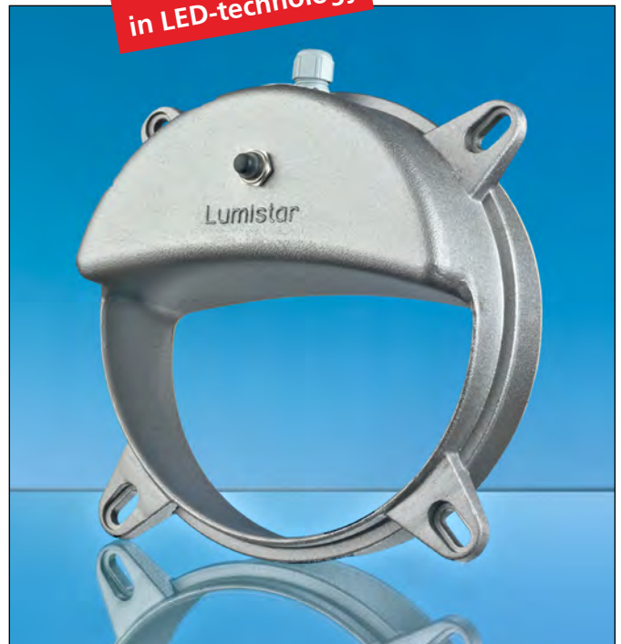
A complete unit, as supplied, of Lumiglas luminaire Lumistar