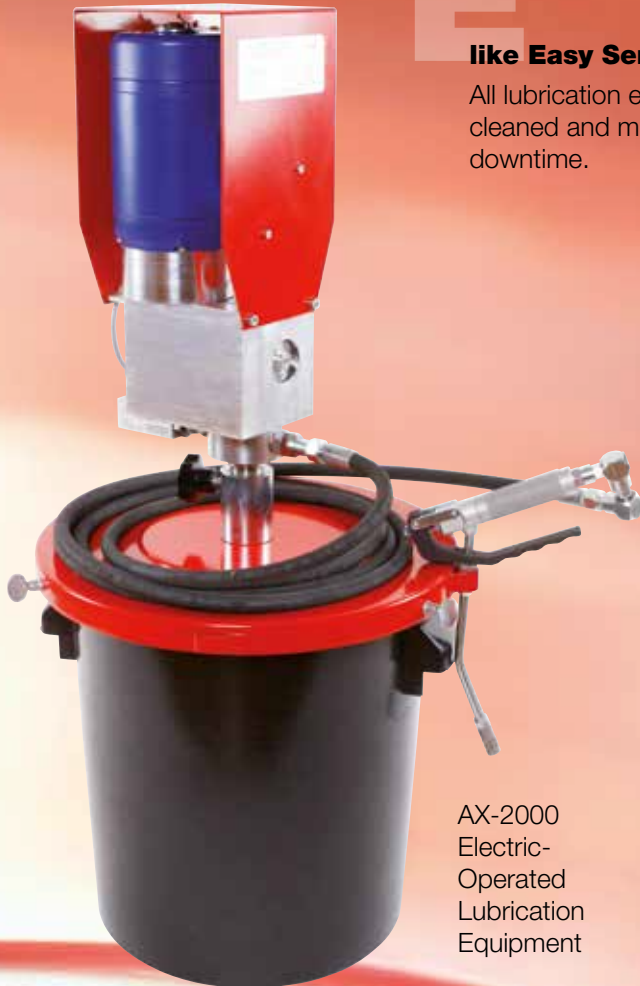
AX-2000 Electric- Operated Lubrication Equipment