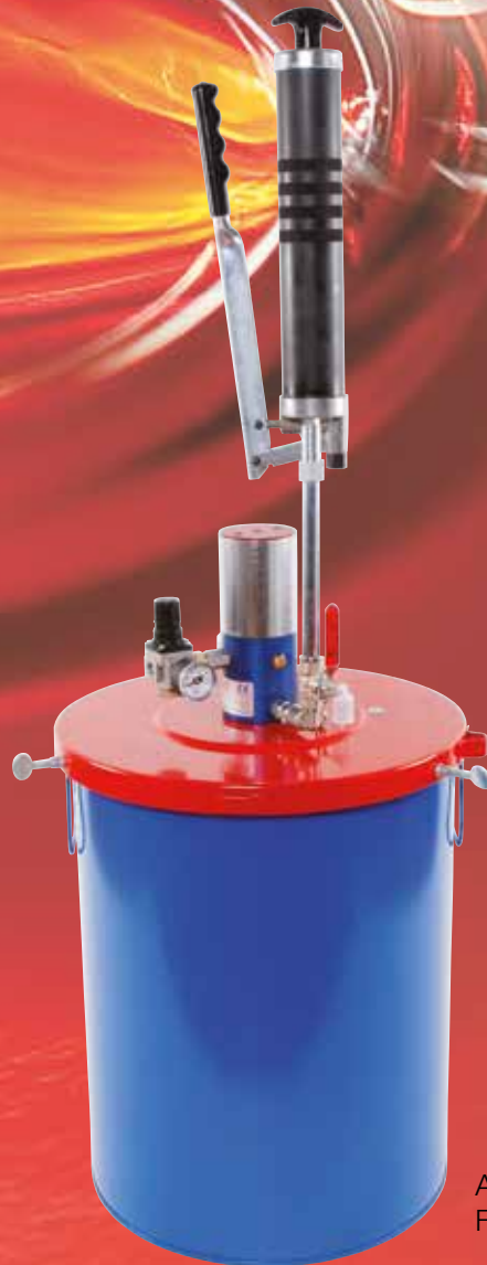
Air-Operated Filler Pump