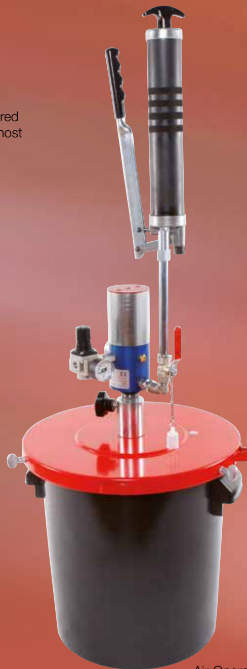
Air-Operated Filler Pump