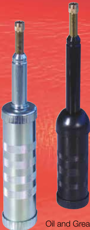
Oil and Grease Hand Push Pumps

Maximum comfort – that's what you will get from our electric hand pump, which is particularly appropriate for use at low temperatures and for the application of viscous lubricants (up to NLGI 3) without function restrictions.