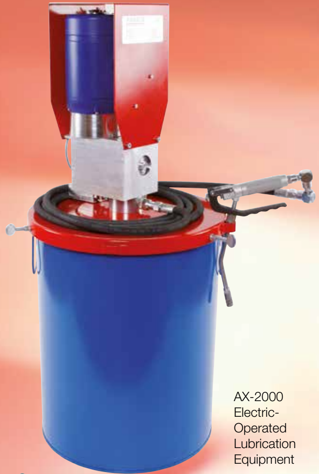
AX-2000 Electric- Operated Lubrication Equipment