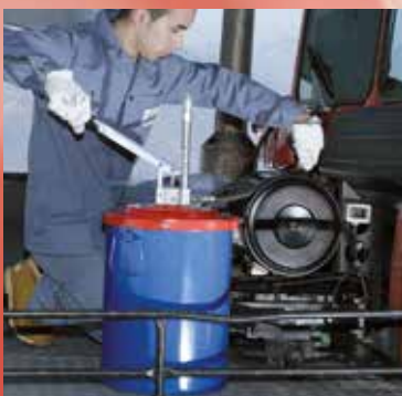
Hand-Operated Lubrication Equipment (only 14-18 kg)

Lubrication equipment and filler pumps are available for all customary containers from 14 to 180 kg.