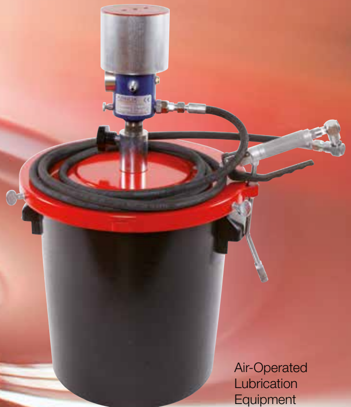
Air-Operated Lubrication Equipment

The electric-operated and air-operated lubrication equipment works with outstandingly low noise for safe operation without noise protection.