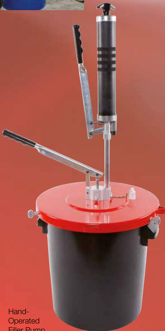
Hand-Operated Filler Pump

All lubrication equipment is manufactured in the proverbial Swiss quality with utmost precision.