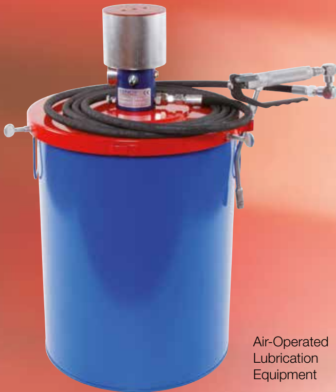
Air-Operated Lubrication Equipment

Process reliability can only be guaranteed if the supply of lubricants is secured. For this reason, ABNOX offers a complete range of filler pumps, lubrication equipment and container hand-operated pumps.