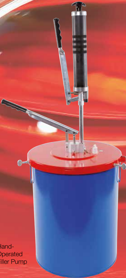
Hand- Operated Filler Pump