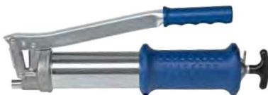
Type ULTRA 75/PKU