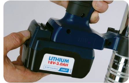
The 18 V lithium ion battery easily slides on and locks into place